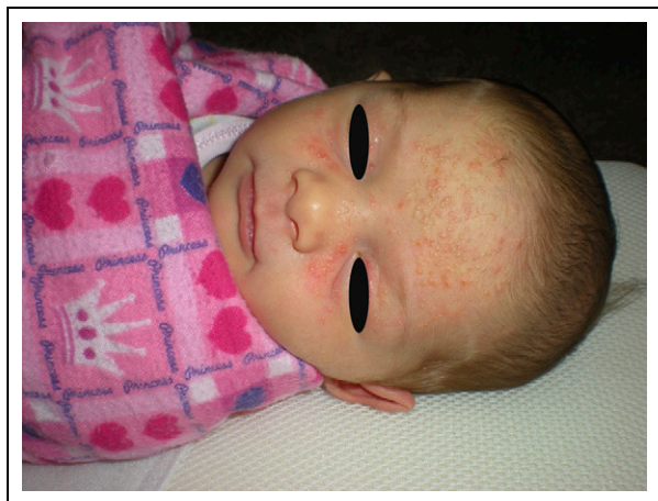
Figure 2. Neonatal acne.

to stimulation of sebaceous glands by maternal androgens and colonization with yeast species. Malassezia furfur and Malassezia sympodialis often are visible on pustule smears. Whether what most pediatricians know as neonatal acne is true acne is controversial. Many pediatric dermatologists prefer the term neonatal cephalic pustulosis to describe this common neonatal process. Most cases resolve spontaneously in several weeks and do not require treatment. In pronounced cases, ketoconazole cream, 2% or hydrocortisone cream, 1%, can be used. If true comedones or nodular lesions are noted, the child should be treated for infantile acne.