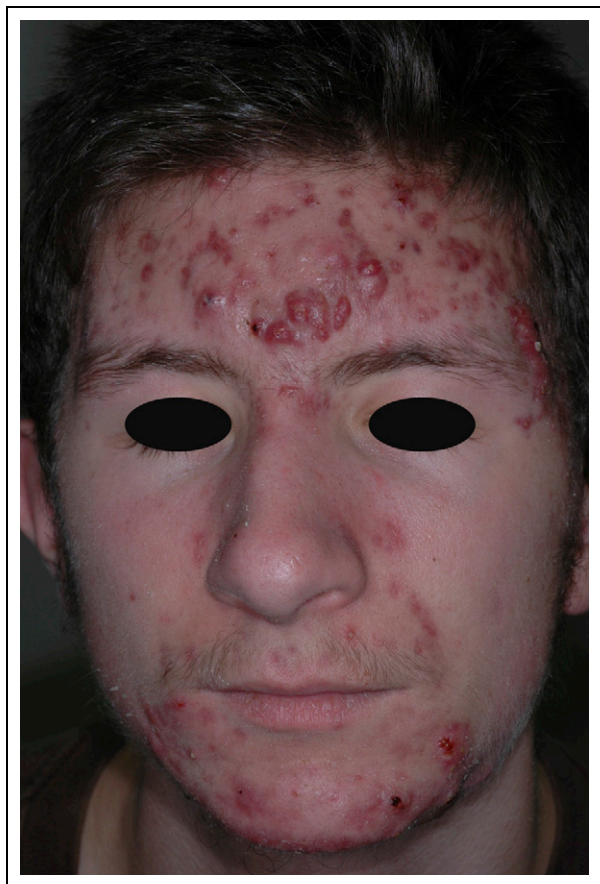
Figure 8. Severe acne.

making it a useful adjunctive therapy in patients being treated with topical or oral antibiotics. (38)(39)(40)