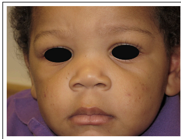
Figure 3. Infantile acne.

It is important to treat even mild cases of infantile acne because scarring is significantly more common in this age group. Up to 50% of these infants can develop pitted scars on their cheeks as a consequence of acne. (27) Treatment with a mild retinoid, such as adapalene gel, 0.1%, or tretinoin cream, 0.025%, may be used daily with benzoyl peroxide cream, 2.5%. Certain formulations, such as washes and alcohol-based gels, should be avoided in infants because of the risk of irritation of skin and eyes. For treatment of more severe inflammatory