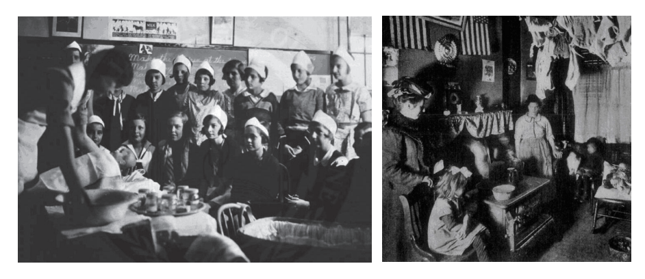
Public health nurses visit a classroom to distribute medicine to school children. Title V is the longest-standing public health legislation in American history and continues to work to improve the health of women and children.

President Roosevelt also succeeded in creating income security programs for children, including the first food stamps program of the Social Security Act.