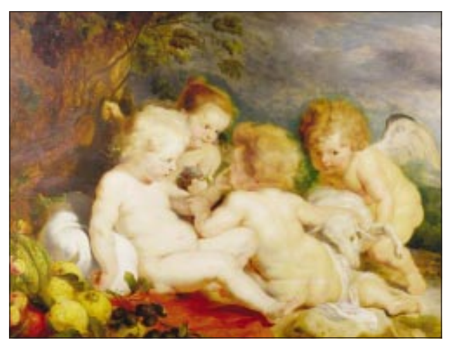
The group learning process: acquiring desirable learning skills

Students elect a chair for each PBL scenario and a "scribe" to record the discussion. The roles are rotated for each scenario. Suitable flip charts or a whiteboard should be used for