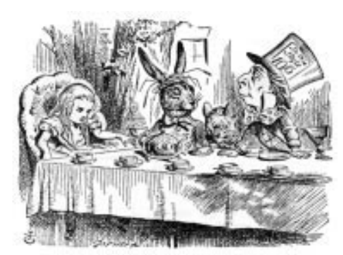
A dysfunctional group: a dominant character may make it difficult for other students to be heard