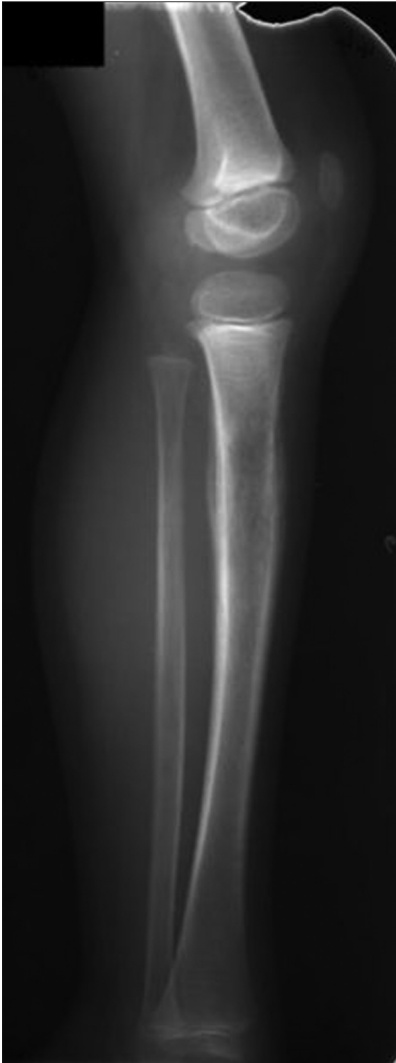
Figure 2. Lucent lesion of Ewing sarcoma in the proximal tibia with poorly defined borders and aggressive periosteal reaction.

clude respiratory distress in huge chest wall primary tumors and signs of cord compression in paraspinous or vertebral primary tumors.