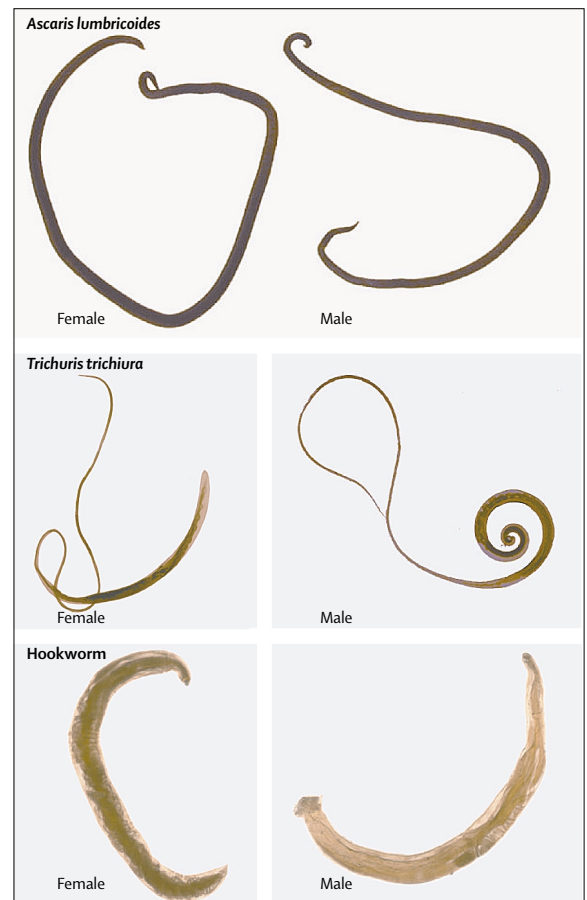
Figure 1: Adult male and female soil-transmitted helminths Reproduced with permission. 10

Soil-transmitted helminth infections are widely distributed throughout the tropics and subtropics (table 3). Climate is an important determinant of transmission of these infections, with adequate moisture and warm temperature